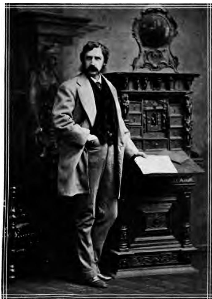
FRANCIS BRET HARTE